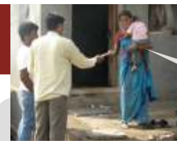
A rag picker family on Immunization

My child's vaccinations were all due because I didn't know when to take the vaccine. My child was identified by KMRF and their continuous motivation made me go to the center for vaccination.