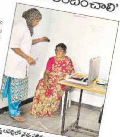
నక్కలపల్లిలో వైద్యపరీక్షలు నిర్వహిస్తున్న వైద్యులు సమీక్షలు చేపట్టారు. ఆయనకు సలహాలను తెలిపారు.

మొయినాబాద్, న్యూఢిల్లీ: గ్రామీణులకు ప్రజలకు వైద్య సేవలను అందించుట అత్యంత ముఖ్యమైనది. ముందుకు రావాలి. వ్యవస్థలను ఏర్పాటు చేయాలి. ముందుకు వచ్చిపోవాలి. అలాగే వైద్య సేవలను అందించాలి. ఈ సందర్భంగా ఆయన మాట్లాడుతూ గ్రామీణులు సులభంగా ఆయన మాట్లాడుతూ గ్రామీణులకు వైద్య సేవలను అందించాలి. అలాగే వైద్య సేవలను అందించాలి. అలాగే వైద్య సేవలను అందించాలి.