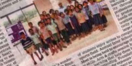
Students of Anzagar Primary School (Burrjuruwa School), a school adopted by the KMR Foundation, displayed their art & craft work on Saturday at Balabharani in Sreenidhi International School, Hyderabad.

The KMR Foundation adopted Anzagar Primary School (Burrjuruwa) school where the children are engaged in art & craft work in the KMR's Education program. The exhibition was held at the school premises. The children displayed their art & craft work. The exhibition was held at the school premises. The children displayed their art & craft work.