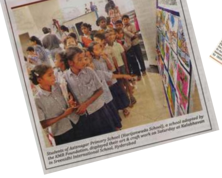
Students of Anzagar Primary School (Burrjuruwa School), a school adopted by the KMR Foundation, displayed their art & craft work on Saturday at Balabharani in Sreenidhi International School, Hyderabad.