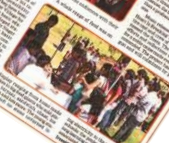
Students of Anzagar Primary School (Burrjuruwa School), a school adopted by the KMR Foundation, performed on Saturday at Balabharani in Sreenidhi International School, Hyderabad.

The KMR Foundation organized a fiesta for a cause. The event was held at the school premises. The children displayed their art & craft work. The event was held at the school premises. The children displayed their art & craft work.