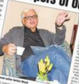
Renowned writer Amittav Ghosh.

Amittav Ghosh tells a forgotten Indian story and reminds us of our responsibility to chronicle our past for posterity. He is a writer who has written several books on Indian history. He is a writer who has written several books on Indian history. He is a writer who has written several books on Indian history.