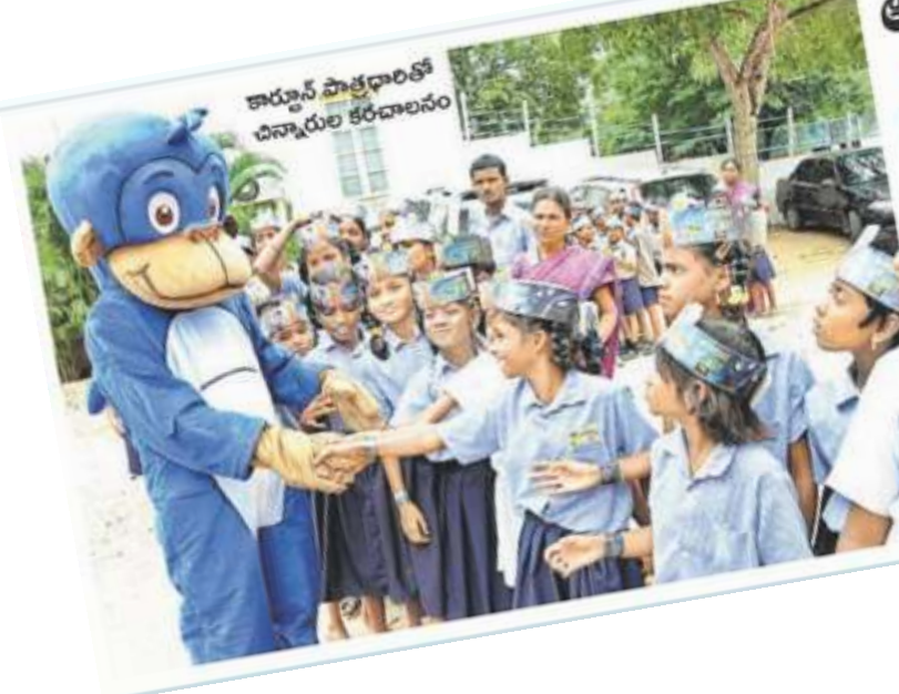
కార్యక్రమ పాఠశాలలో చిన్నారుల కరదానం.